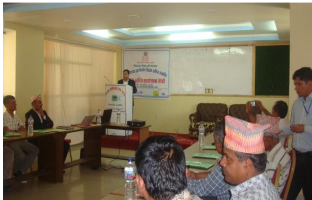
Figure 1: DEO's welcome speech

The Consultative Workshop held at the Hotel Miracel, Haramtari, Gorkha on 4-6 August 2016, with an objective to prepare a draft of teacher training action plan for reduction the disaster hazards and Advocate for the integration of "safe school" standards and DRR curriculum into district-level education policies . The workshop was facilitated by WVAF in collaboration with DEO for the content development of Teachers Training. More than 40 participants were participated in the workshop. Executive Director of WVAF and Senior officers from FCA including DEO, Asst. DEO, school supervisors, resource persons and staff of local NGOs, INGOs from Gorkha are taking part in the workshop